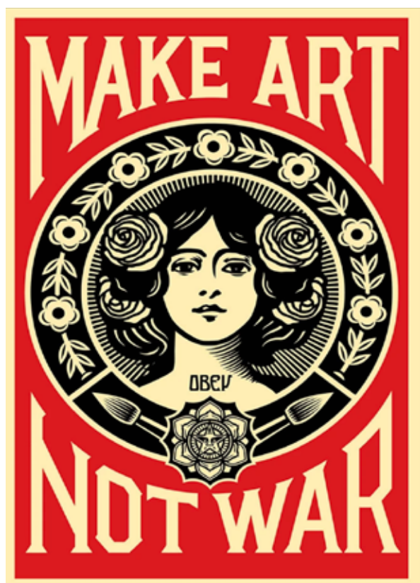
Make Art Not War, Shepard Fairey

While we integrate the ever-updating data that's helping us answer these questions, museums across the world have begun offering virtual tours, posting hands-on how-tos with educators, and finding other innovative ways to gather people together online. At Poster House, one of the especially creative efforts has been our social media series #museumathome, which offers staff the opportunity to show off some of their own fabulous posters.